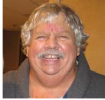
Chip Hearn Ice Cream Store & Peppers